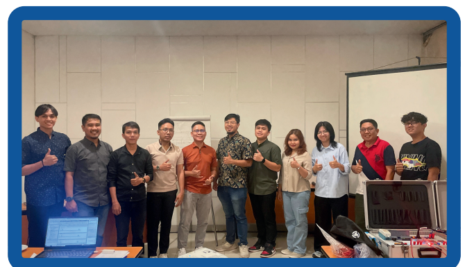
Pelatihan dan Sertifikasi BNSP PLC SIEMENS Onsite Cilegon