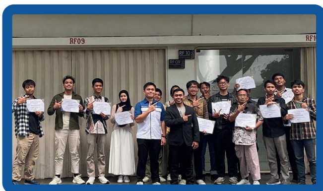
Pelatihan dan Sertifikasi BNSP PLC OMRON Onsite Bekasi