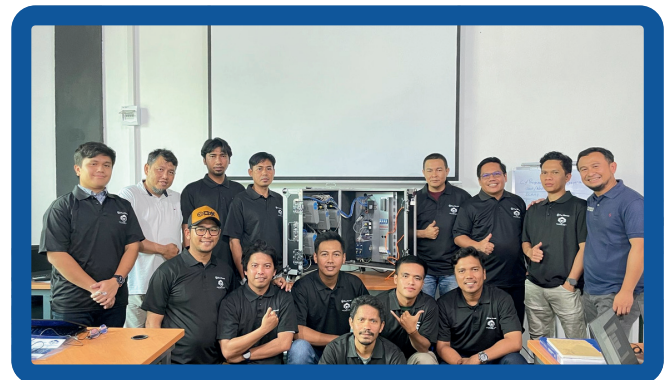
Training DCS Experion LXC300 Batam Training Academy