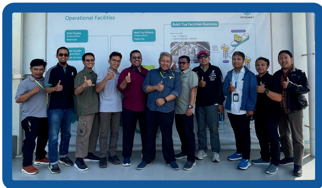
Training DCS C300 Petronas ORF Surabaya 2 Batch